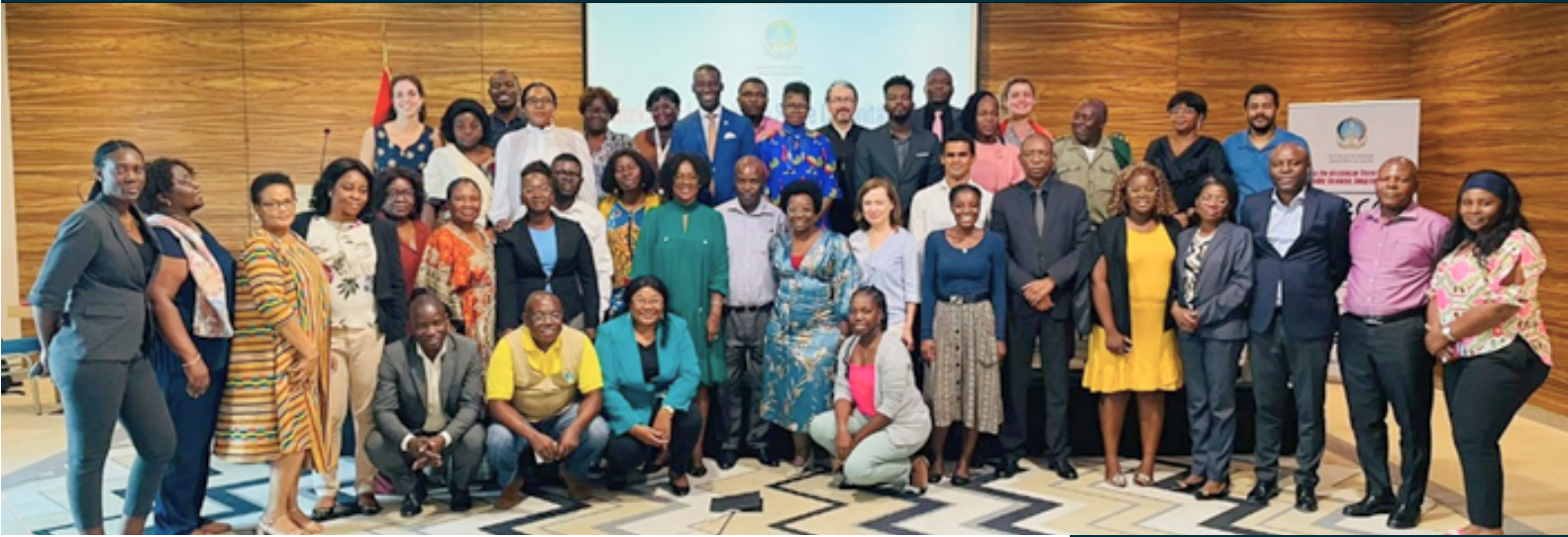
Angola Community Health Digitalization Workshop Participants.

OCTOBER 2023 | @DIGITALSQR | PMICORE@PATH.ORG