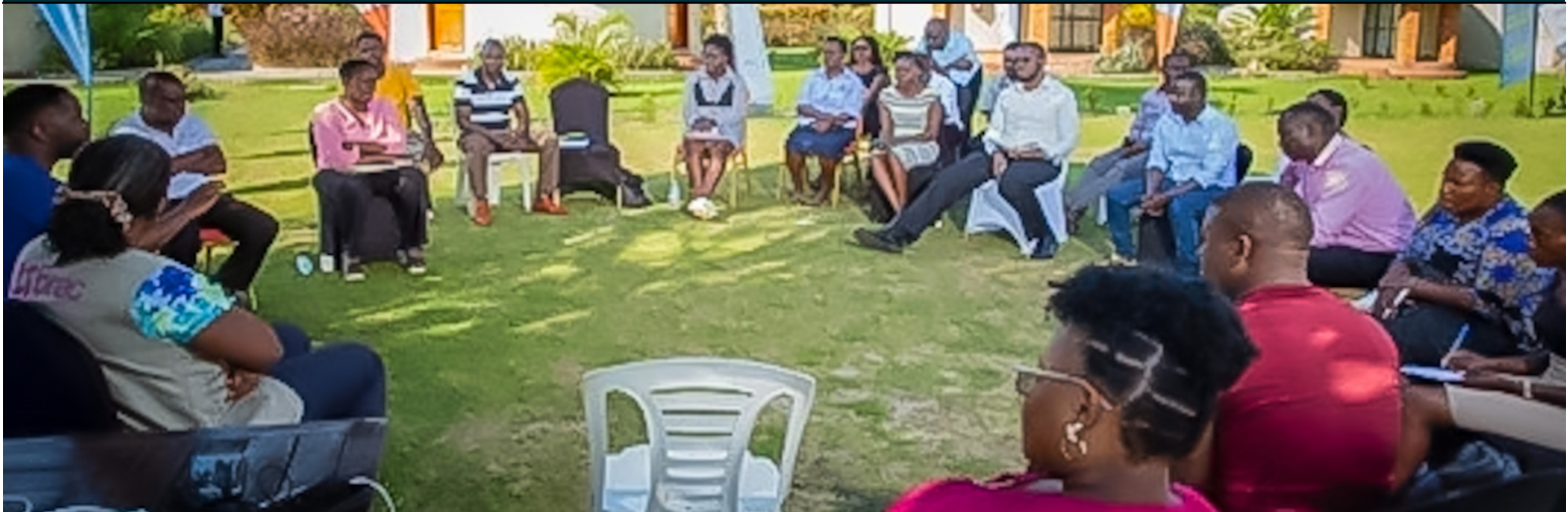
eCHIS modules group discussion during a Ministry of Health retreat in Kalangala Island, Uganda.

FEBRUARY 2023 | @DIGITALSQR | PMICORE@PATH.ORG